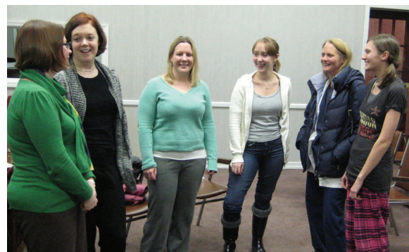
Board members after a planning meeting for upcoming spring events

Advisory Board is planning the second annual Global Youth Services Day and an After High School Forum that will focus on the many different paths high school students can take after their senior year.