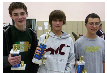
Senior Division Winners

Each player received a commemorative medallion and a roll-up chess board. Trophies were awarded to