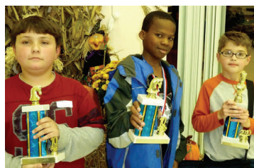
Junior Division Winners